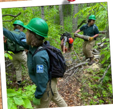
GREAT LAKES CLIMATE CORPS