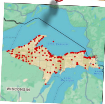
RECENT PROJECT LOCATIONS