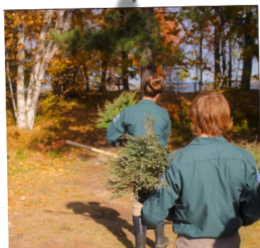
FALL EXTENSION OPPORTUNITIES