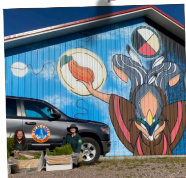
GREAT LAKES TRIBAL CONSERVATION CORPS