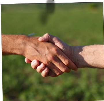
PROVIDE PUBLIC FIREWISE EDUCATION