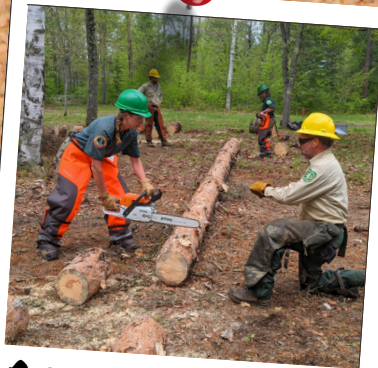
RECEIVE CHAINSAW CERTIFICATIONS