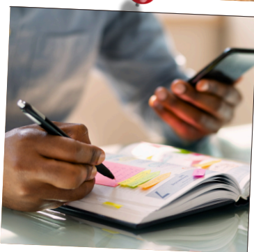
BOOK APPOINTMENTS WITH HOMEOWNERS