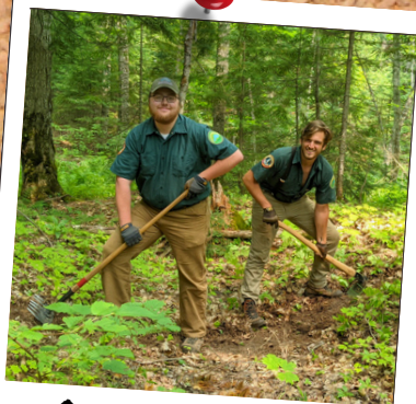
OTTAWA TRAIL CREW