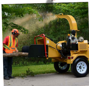
CHIP BRUSH PILES