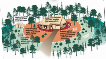
CONDUCT FIREWISE ASSESSMENTS