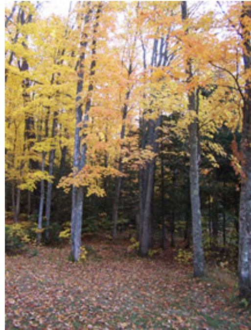
(Fig. 7) Maple Grove with Autumn Colors

Sugar Maple: The most concerning of all tree species' decline lies is the Sugar Maple in the western half of the Upper Peninsula. While the Sugar Maple of Alger County has not declined at the same rate, Sugar Maple in nearby counties has declined by 5-28%. A combination of soil conditions, management practices, and drought are considered predominant factors in its decline. Sugar Maple is considered the most important species to the timber products industry and is celebrated for its brilliant reds in the autumn season making it instrumental to the short, but lucrative, fall color tourism season.