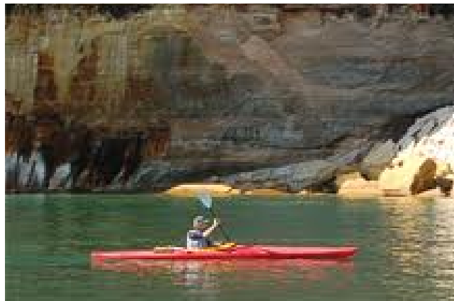
(Fig. 15) Kayaking on the Great Lakes

The county's northern boundary is composed entirely of Lake Superior coast line. The Munising Bay Watershed (MBW) includes all surface waters that drain into Lake Superior at Munising Bay, including portions of the Pictured Rocks National Lakeshore. The MBW is comprised of 36,296 acres. There are four Minor Civil Divisions in the MBW, including Au Train Township (22,670 acres), Grand Island Township (830 acres), the City of Munising (3,364 acres), and Munising Township (9,431 acres).