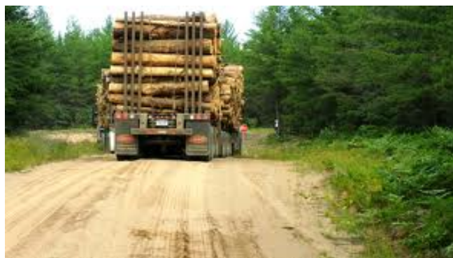
(Fig. 17) Logging Truck on Back Road

The overall labor force in Alger County is 4,050 with 3,525 people employed. The unemployment rate is 12.8%. According to the Local County Economic Development Contract, 2007 , the largest employer in Alger County is the Alger Maximum Security Prison (369). Neenah Paper employs 315 people and TimberProducts employs 230. Another 17 people are employed at the Munising's regional office of the Hiawatha National forest. There are also several other small forestry related businesses within Alger County; 12 of these concerns have received training through the Sustainable Forest Education program. Other significant employers in the MBW are the Christmas Kewadin Casino (120 ppl), Munising Memorial Hospital (96 ppl), Munising Public Schools (90 ppl), Glen's Market (36 ppl), County of Alger (36 ppl), Pictured Rocks National Lakeshore (35 ppl), and the People's State Bank (32 ppl). Two Public School Districts sit within the MBW: AuTrain-Onota public schools (a preK-8 school district with total school enrollment: 30 students) and Munising Public Schools (student enrollment: 708, employment: 90).