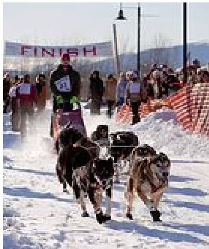
(Fig. 18) Dogsled Race