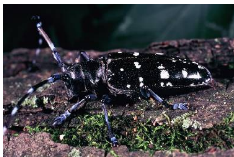
(Fig. 6) Asian Longhorn Beetle

The largest threats to the health of Alger County forests are invasive pests and disease. There are several worrisome pests, including the Emerald Ash Borer, the Hemlock Woolly Adelgid, and the most concerning, the Asian Longhorn Beetle. The Asian Longhorn Beetle was discovered in Massachusetts in 2008 and has most recently been detected in Ohio. The Asian Longhorn Beetle has not been detected in Michigan; however, due to its particularly destructive nature, this pest presents the largest concern to Alger County due to its ability to quickly decimate 11 species of deciduous trees including certain varieties of birch, aspen, and maple (including Sugar Maple). As maple is the most dominant species in Alger County forests, and Sugar Maple the most important species economically, this pest stands to impact Alger County forests more than any other. According to a 2010 report from the Michigan Department of Natural Resources and Environment, intensive state-wide response surveys to Asian Longhorn Beetle were conducted at Michigan state parks and campgrounds in the spring of 2011 (MDNRE 2010).