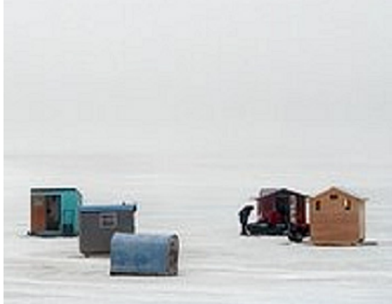
(Fig. 11) Fishing Huts on Frozen Lake