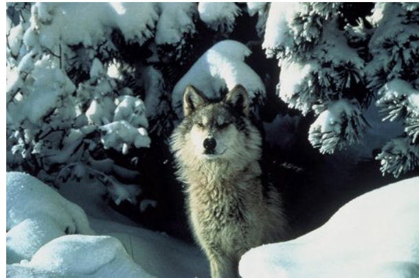
(Fig. 4) Wolf in Winter

Alger County is home to 9,601 people as well as a variety of wildlife. The forests of Alger County provide habitat for black bear, moose, white tail deer, gray wolf, and the endangered Kirkland warbler, as well as a variety of other species. The forests also provide cover for many rivers and streams. Hemlock, Birch, and Aspen serve as habitat for game birds including partridge, grouse, and pheasant.