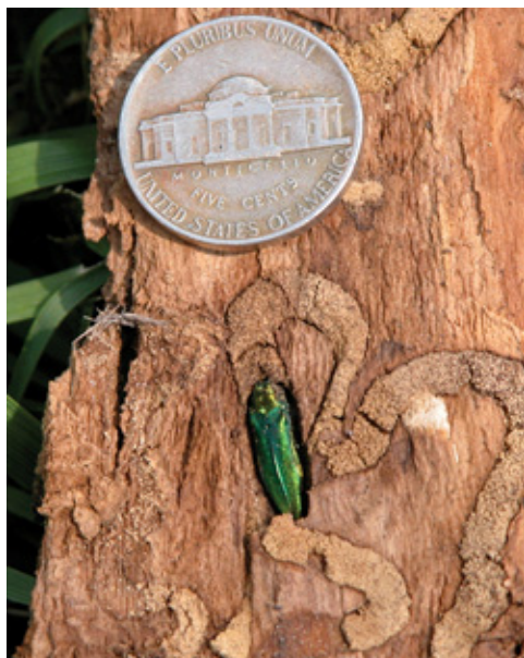
(Fig. 5) Insect Damage in Wood

The largest threats to the health of Alger County forests are invasive pests and disease. There are several worrisome pests, including the Emerald Ash Borer, the Hemlock Woolly Adelgid, and the most concerning, the Asian Longhorn Beetle. The Asian Longhorn Beetle was discovered in Massachusetts in 2008 and has most recently been detected in Ohio. The Asian Longhorn Beetle has not been detected in Michigan; however, due to its particularly destructive nature, this pest presents the largest concern to Alger County due to its ability to quickly decimate 11 species of deciduous trees including certain varieties of birch, aspen, and maple (including Sugar Maple). As maple is the most dominant species in Alger County forests, and Sugar Maple the most important species economically, this pest stands to impact Alger County forests more than any other. According to a 2010 report from the Michigan Department of Natural Resources and Environment, intensive state-wide response surveys to Asian Longhorn Beetle were conducted at Michigan state parks and campgrounds in the spring of 2011 (MDNRE 2010).