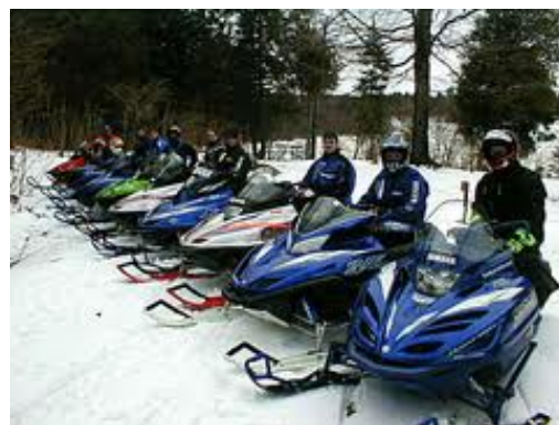
(Fig. 19) Snowmobiles

Over the last ten years, various economic development clubs and organizations in Alger County have worked to develop a clear message, publicizing the area's natural beauty: Alger County is a destination for outdoor enthusiasts and silent sport, hunting, or off-road vehicle use, and the county has worked hard to ensure devotees will be well accommodated. The official Alger County website offers several electronic documents devoted to outdoor recreation including detailed hiking and mountain bike trails, groomed cross-country ski trails and snowmobiling trails, and the location of over 20 of the county's waterfalls. Many shipwrecks in Lake Superior are now protected in bottomland preserves and accessible to recreational divers. In 1985, scientists using a submersible vessel descended for the first time to the deepest part (-1,333 ft./-405 m) of Lake Superior near Pictured Rocks National Lakeshore. Tourism related to shipwreck viewing continues to increase.