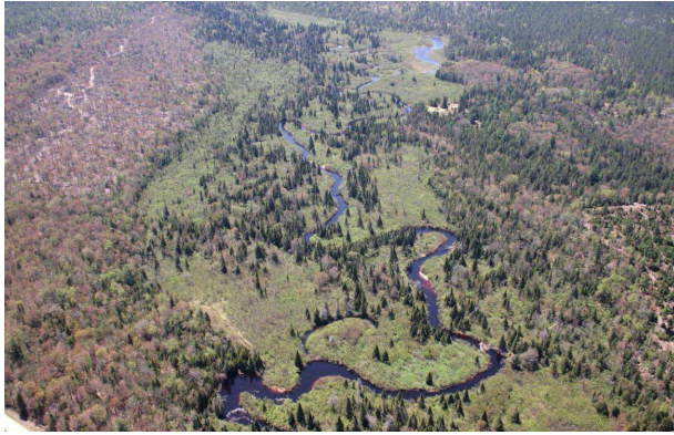
(Fig. 12) Aerial View of Meandering River