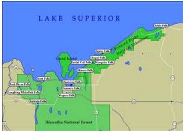
(Fig. 14) Alger County Shaded in Green

Alger County is a rural community positioned in the central Upper Peninsula of Michigan. According to the 2010 Census, there are 9,601 people in Alger County, with 10.5 people per square mile. Alger County falls below the state average in average household income (a $7,000 disparity) and owner-occupied home value ($111,700 to the state average of $147,500). Residents aged 50+ comprise the largest demographic and there was a 2.6% population decline compared to the state decline of 0.6%. Alger County, and specifically the MBW, is an economically depressed area with approximately 12.8% of its residents unemployed.