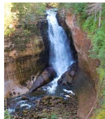
(Fig. 16) Waterfall in Forest

Several state and federal lands sit within Alger County and the MBW boundary: Pictured Rocks National Lakeshore, the Hiawatha National Forest, and Michigan State Forest Lands. The total federal land payment to Alger County is $423,951; comprised of $302,188 from Payments in Lieu of Taxes (PILT) monies and $121,763 from Forest Service Payments.