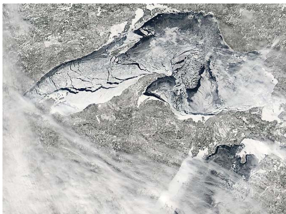
(Fig. 10) Satellite Image of Lake Superior

All of the Great Lakes have been experiencing lower water levels, setting the stage for severe consequences to shoreline infrastructure. The shipping industry and coastal ecosystems, and the measureable levels of Lake Superior represent a particularly complex set of man-made and natural influences. Due to an international agreement with Canada, the International Joint Commission mandated that a specific volume of water had to flow through the Canadian St. Mary's rapids (located immediately north of the American Soo Lock complex on the eastern end of the lake); due to this arrangement, the lake levels are often manipulated at the Soo Locks. However, even with that consideration and minor annual fluctuations in water levels, the summer of 2011 saw the lake sitting 11 inches below the long-term norm for that time of year (Duluth News Tribune 2011). According to Minnesota's SEAGRANT/NOAA, a loss of an inch in water depth translates into a loss of 270 tons of cargo for large vessels (Moen 2006).