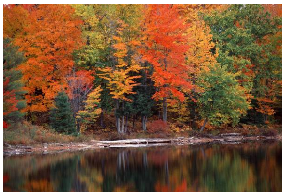
(Fig. 3) Fall Colors on Lake

The State of Michigan has more forestland than any other state in the Northeast or Midwest; Alger County serves as a perfect illustration of this fact. At 918 sq. miles area, Alger County, located on the southern edge of Lake Superior in the central Upper Peninsula of Michigan, owes its topography to the glaciers that moved through the region over 10,000 years ago. Once covered by a kilometer of glacial ice, Lake Superior and its surrounding lands took their final shape 6,000 years ago.