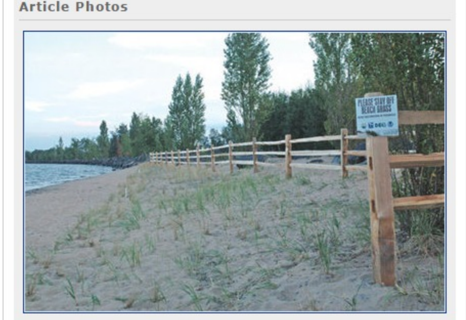
The Superior Watershed Partnership has planted beach g...

The Marquette City Commission held a Tuesday work session to hear a presentation on the final draft of plans, which were created by a project team consisting of the city of Marquette Community Development Department and the Superior Watershed Partnership. Baird, a coastal-consulting company, provided oversight.