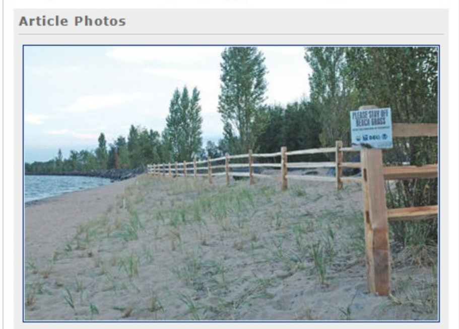
The Superior Watershed Partnership has planted beach g...

The Marquette City Commission held a Tuesday work session to hear a presentation on the final draft of plans, which were created by a project team consisting of the city of Marquette Community Development Department and the Superior Watershed Partnership. Baird, a coastal-consulting company, provided oversight.