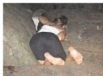
26 Hangovers Caught On Camera. Will You Be Next?