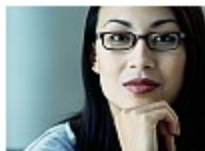
Monitor your credit. Manage your future. Equifax Complete™ Premier.