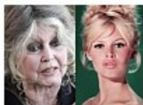
As they've gotten older, these stars have become more and more unattractive.