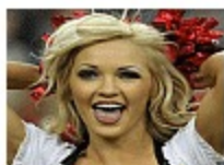
Biggest Cheerleader Wardrobe Fails!