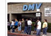
Why didn't they tell drivers about this new rule? If you drive less than 35 mi/day read this...