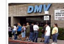
Why didn't they tell drivers about this new rule? If you drive less than 35 mi/day read this...