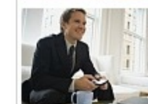
Monitor your credit. Manage your future. Equifax Complete™ Premier.