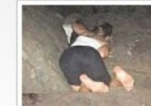
26 Hangovers Caught On Camera. Will You Be Next?