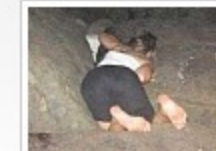
26 Hangovers Caught On Camera. Will You Be Next?