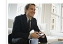
Monitor your credit. Manage your future. Equifax Complete™ Premier.